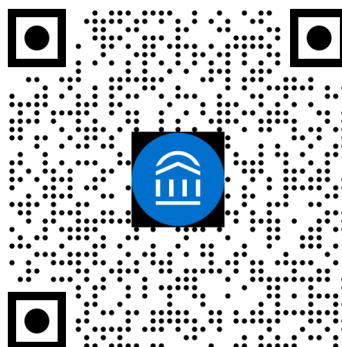
Navigate App - iOS